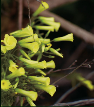
2. Inside front cover