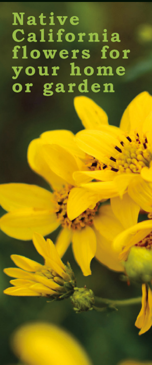
1. Front Cover

Native California flowers for your home or garden