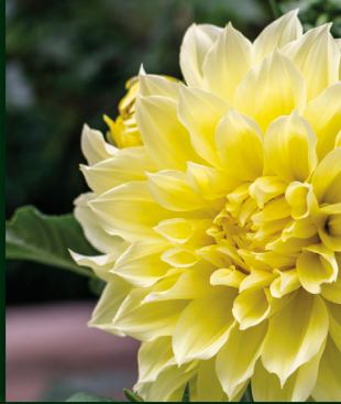
4. Inside panel

A minimum amount of watering is required throughout the summer months since they retain water and have full thick leaves or branch like stems. Blooms are typically seen in June through August. Water retention is their best quality, and provide a coverage area for open spaces in sandy soil. Flowers vary in color depending on the species, so check with local nurseries for best varieties.