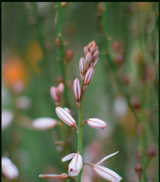
5. Inside fold-in